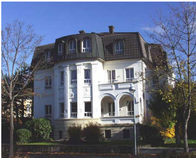
Staffel House in Bad Honnef, Germany

„ Trust is a tender plant. Once destroyed it is slow to grow back. “ Otto von Bismarck (1815 – 1898)